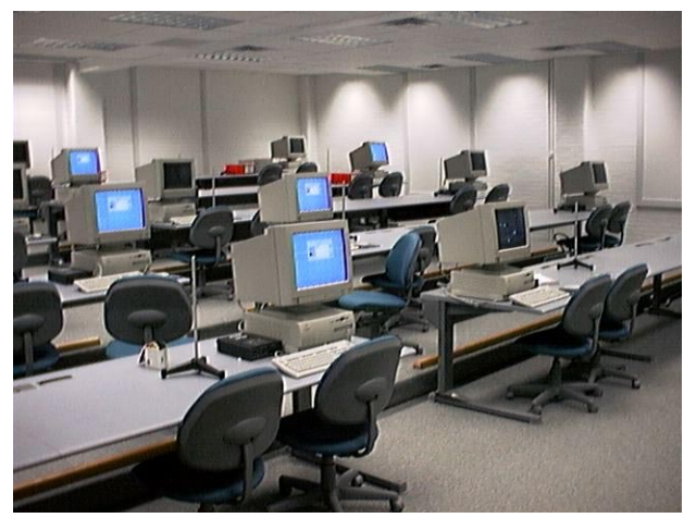
Figure 3. Picture of the computerized classroom (B&L 407) constructed for the Physics by Inquiry course.

For each project, each team hands in one agreed upon design solution. In addition, each student of the team is required to hand in a separate design report, which describes in detail the design process and the final design solution. Each design is tested to ensure it meets the design goals. Examples of different designs of a truss bridge are shown in Figure 1. Figure 2 shows examples of different designs of an aircraft wing.