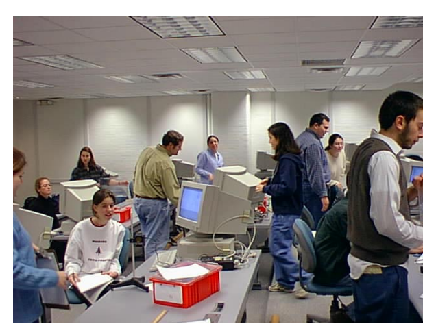
Figure 4. Physics by Inquiry students hard at work in B&L 407.

Physics by Inquiry focuses on the scientific method. The students start from their own observations, develop basic scientific concepts, use and interpret different forms of scientific representations, and construct explanatory