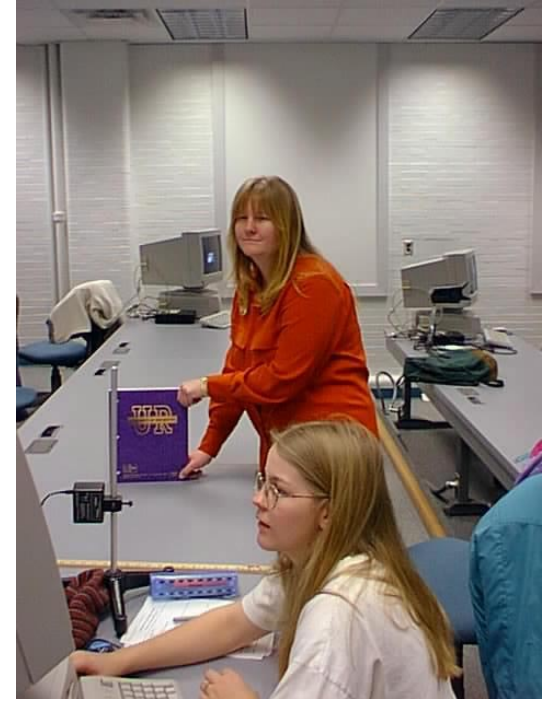
Figure 5. Physics by Inquiry students hard a work in B&L 407, trying to carry out a motion in front of a motion sensor that is shown on a graph on their computer screen.