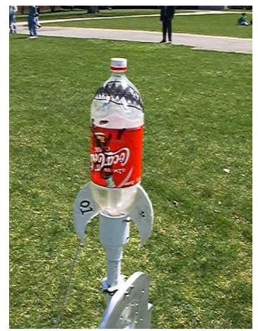
Figure 8. The best performing Physics by Inquiry rocket.