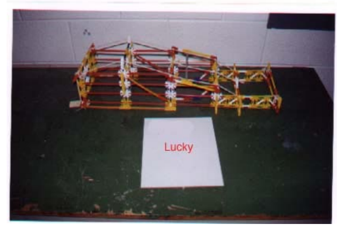
Figure 2. Examples of different designs of an aircraft wing created by students enrolled in ME104Q, Life's Devices .