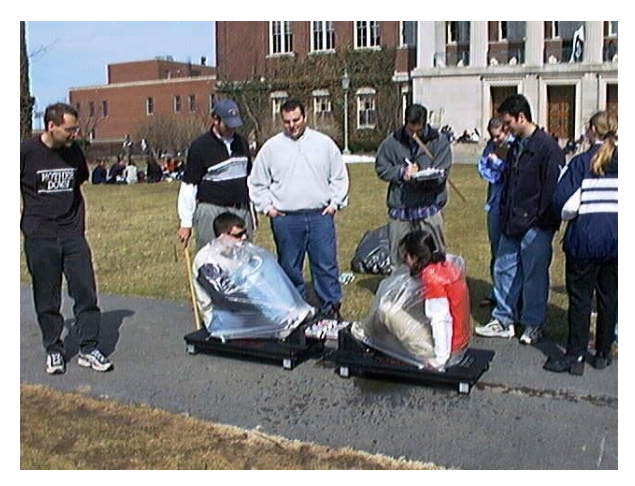
Figure 6. Inelastic collision between 2 Physics by Inquiry teaching assistants, using full soda cans as bumpers.